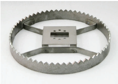
60 STATIONS SQ PAD (FOR BOLT-ON COLLARS)