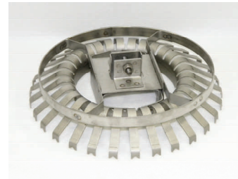
**30 FINGER W/LIMITER**